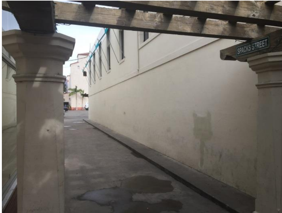
Image #2 - from the outside parking area behind the Granada Garage looking west towards State Street with the North facing wall of 1214 State Street visible